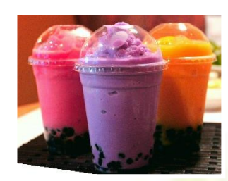
Boba Tea - $5,99

A drink that is fun to eat! Refreshing and delicious, a cool blend of flavors served over sweet and chewy pearls.